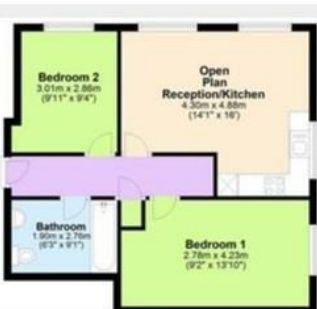
flat 2 45 High Street KL.jpg