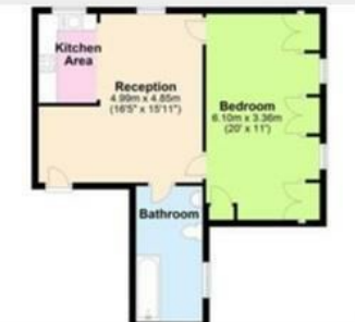
flat 5 45 High Street KL.jpg