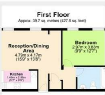
flat 4 45 High Street KL.jpg