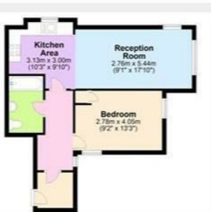
flat 3 45 High Street KL.jpg